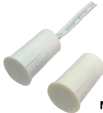
Model : EMC-1010